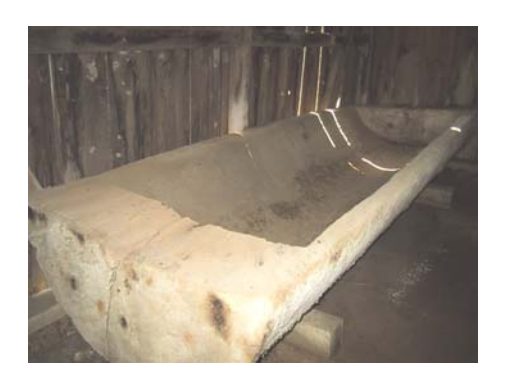
Meat Curing Log - 2005