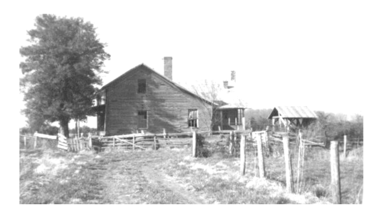
The Old House - circa 1980 or earlier