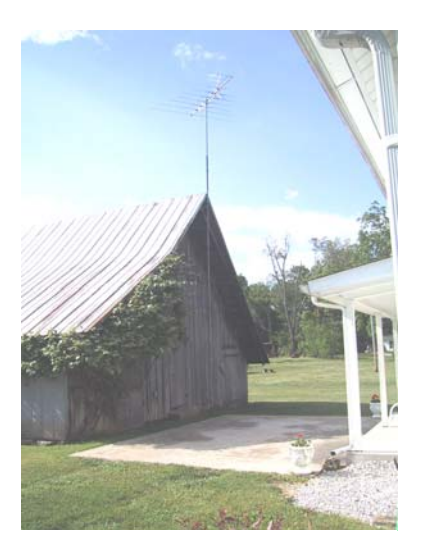
Storage Shed - 2005