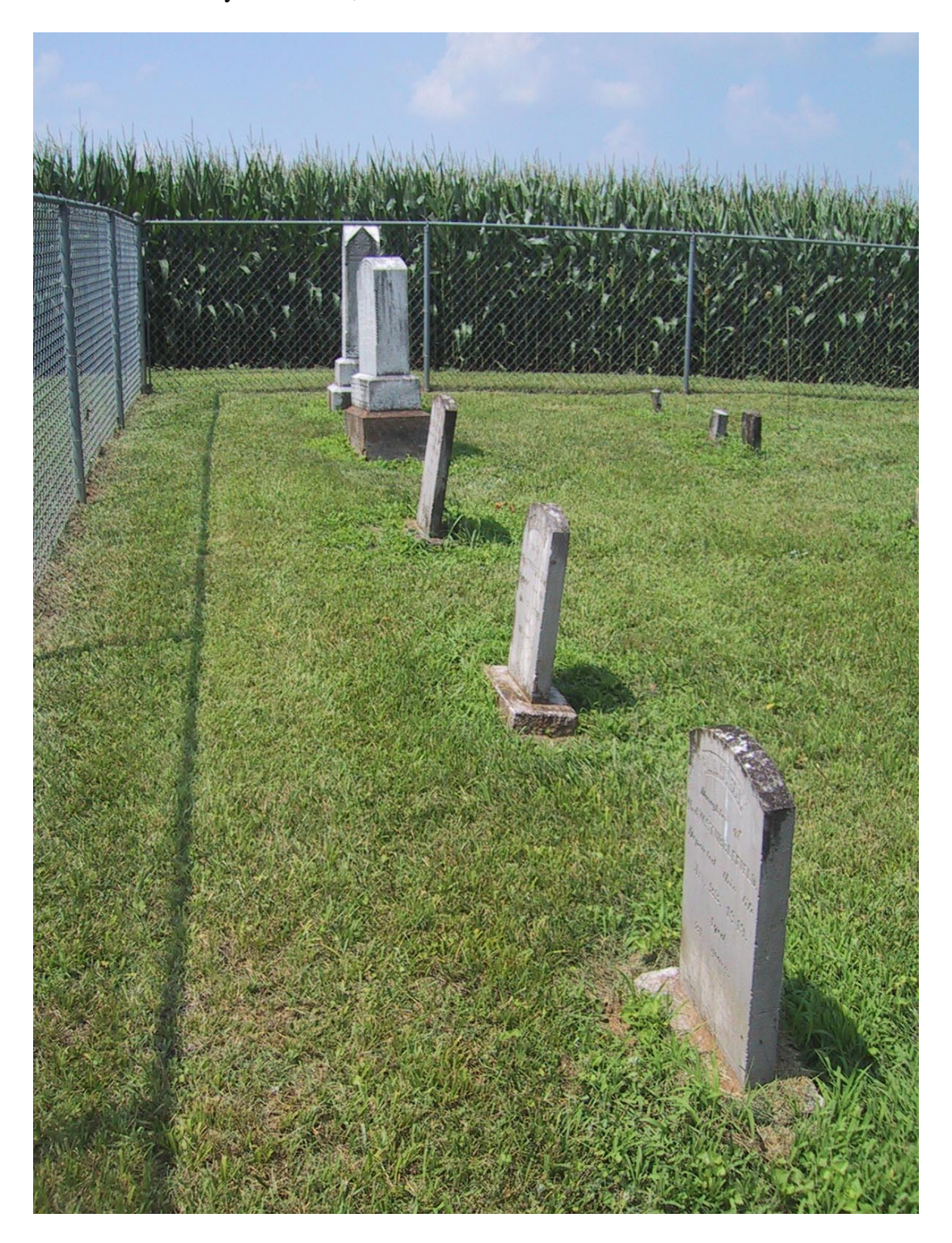
The Stubblefield Cemetery July 2005

4. Stubblefield Cemetery near Viola, TN.