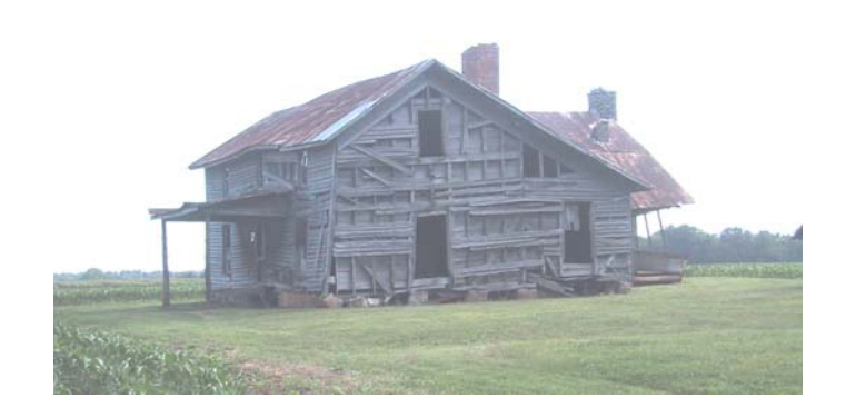
The Old House - 2005