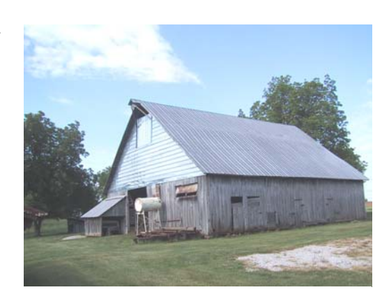
Barn - 2005

Several interesting things have been found in some of the buildings. For example the name Herman Stubblefield and the year 1906 are carved in the barn and the initials JR and a cross are carved on a door of one of the sheds. A battered cedar chest containing old bills pertaining to Royce's auto repair business was stashed in the loft of the granary. We've since restored the chest and now use it in our house to store clothes and blankets. We also restored and are using a dining table that had been left for years on the back porch of the Old House. In a loft over the shed behind the JRS house were probably 50-100 pairs of old shoes and there were many letters to Granny from